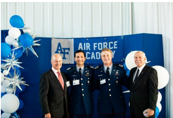
Class of '24 Graduating Seniors