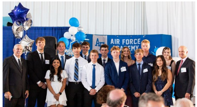
Incoming Class of '28 Appointees